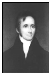
William Ellery Channing