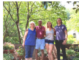
The C.s reunite with daughter and son-in-law, visiting from Paris