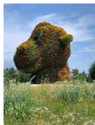
The H.s visit "Split Rocker" outdoor sculpture at the Glenstone Museum in Potomac.