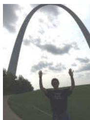
Beloved Prez. at the St. Louis Arch