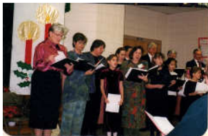
Channing choir, Christmas 2000