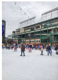
Skaters at Wrigley Field, 2019