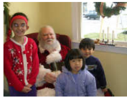
Kids with weird guy, 2006